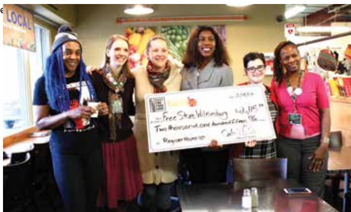
The East End Food Co-op raised $2,115.37 for Free Store Wilkinsburg through the Register Round Up program, where shoppers round up their total to the nearest dollar and donate the difference to charity. A check was presented to Free Store Wilkinsburg during a coffee reception and celebration at the Co-op.