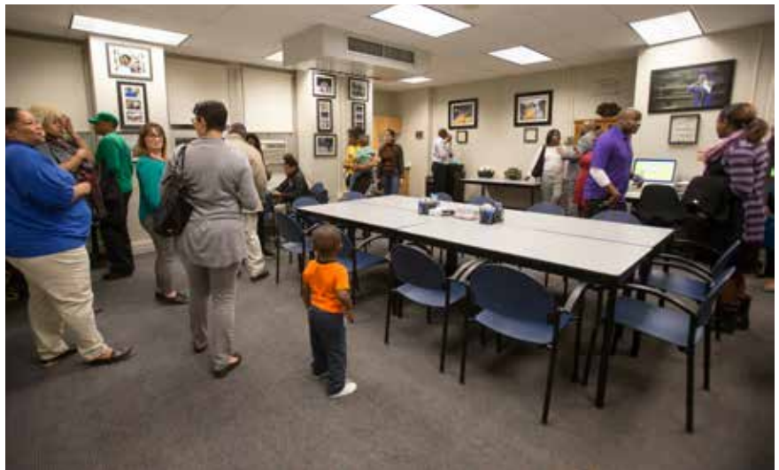
Attendees of February's PSCC meeting tour the new resource center.

resources for all families, both Westinghouse and Wilkinsburg. The parent resource room was created to empower parents, students, and the community for the school's success.