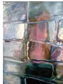
Gateway, by artist Heather Heitzenwater, oil on panel

Emerging and established female artists are coming together for a special exhibition and benefit at Percolate Art Space in Wilkinsburg—inspired by music, political and feminist views.