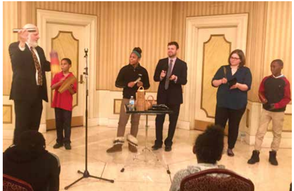
Sixth graders get hands-on experience with PSO percussionists in workshop.

Transition activities like these are meant to form bonds between students and make their 7th grade year a smooth and successful one. And so far, so good. The students report they are really looking forward to writing and receiving more letters!